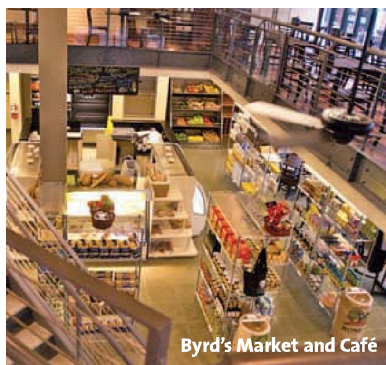
Byrd's Market and Café

Lakefront Patio Local sushi and Japanese robata bar mini-chain Azuma opened a 9,200-square-foot outpost in Sugar Land's new Lake Pointe development in June. Azuma on the Lake includes a lakeside patio that seats 65, with seating for 100 more on the first floor (at a sushi bar, tables, and two party booths) and 90 in the second-floor dining room. (15830 Southwest Fwy., Sugar Land, 281.313.0518, azumarestaurant.com )